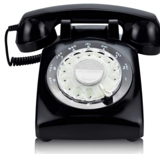
VINTAGE Rotary Telephone

Antiques are items that are 100 years old and older. Vintage items are at least 25 years older and sought after by collectors.