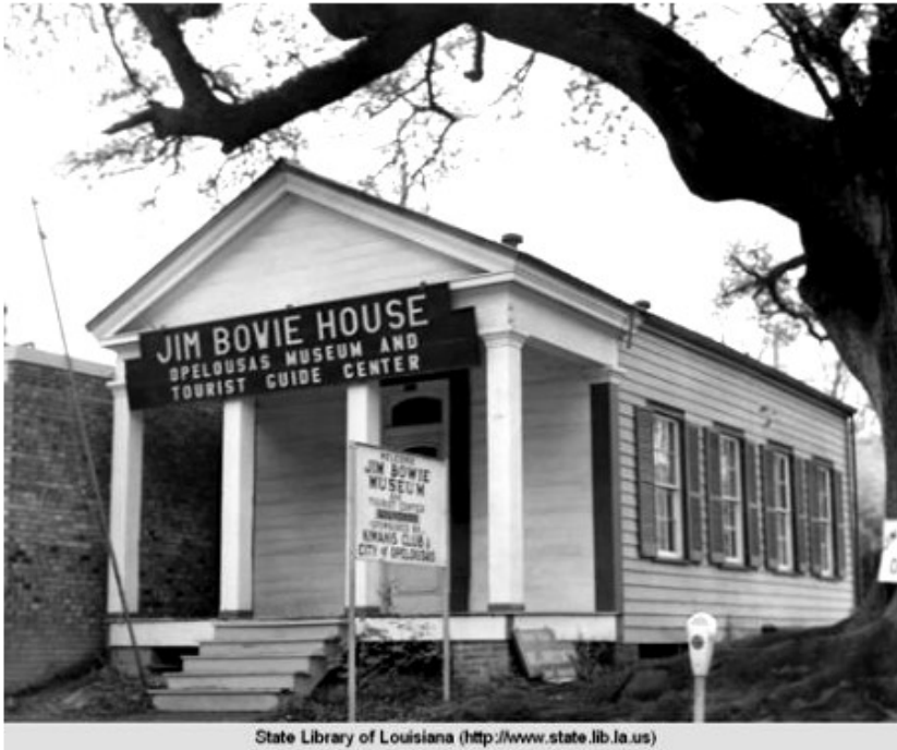
State Library of Louisiana ( http://www.state.lib.la.us )