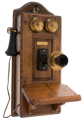
ANTIQUÉ Crank Telephone